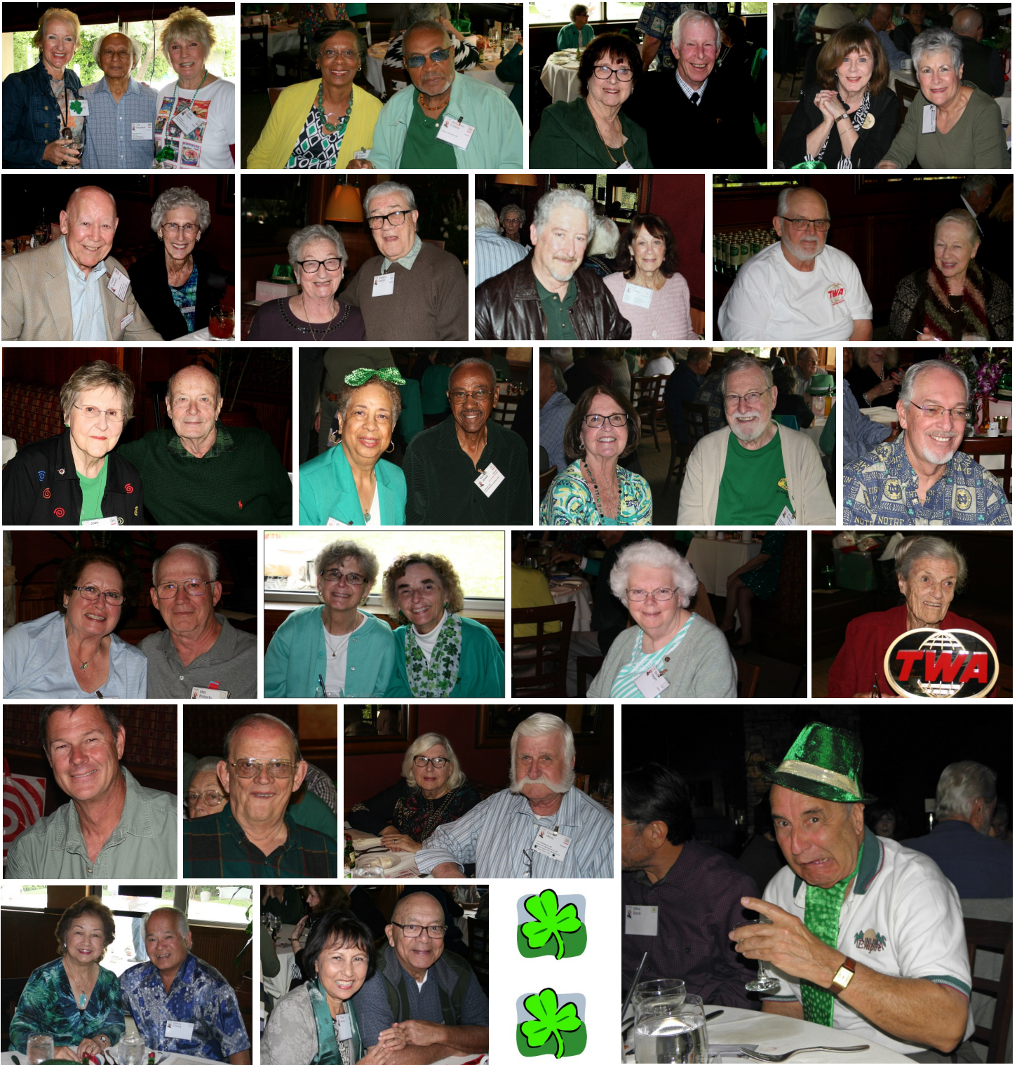
DEFINITELY NOT IRISH WHISKEY COFFEE